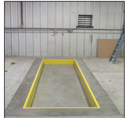
BenchRack 5000 16'-7" long Steel frame enclosure for durability